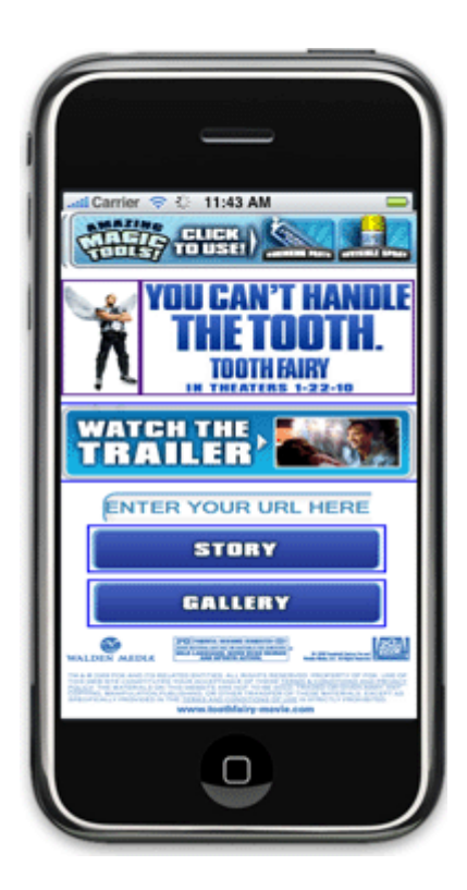
Figure 3: The Final Web Application on the iPhone as tested by Rapidsoft System's Team

Once we got the web page working reliably on both the FireFox and Safari desktop browsers, it was time to try the web page where it really counted: Mobile Safari on the iPhone. We placed the program on a web site, downloaded it to the iPhone, and tapped away at the screen. We noticed that what worked fine on the desktop suddenly became misaligned on the phone. We tried several new changes to the css to align but one or the elements will misalign. After a few css, we decides to make some changes to javascript and with some more testing we were able to get it right.