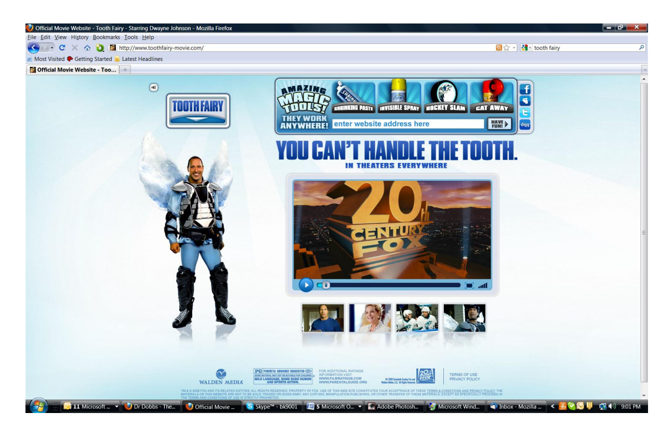
Fig 2: The Second View of the Original Movie Application